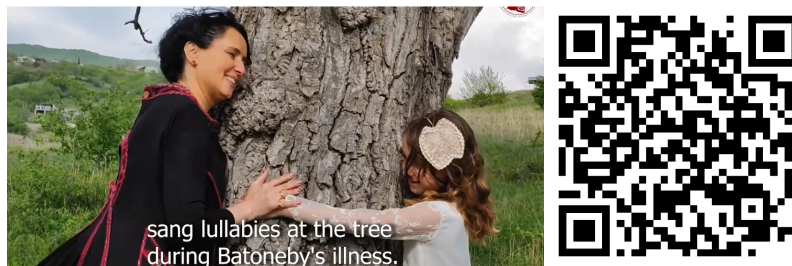
Image 2. Ethnomusicologists' Creative Group Nanina's new project "Restored Song", Meskhetian Batonebi

When taking the first steps, the child was required to walk around the oak tree planted in the family yard. During this ritual, family members sang a lullaby. The purpose of the ritual was symbolic: the child's knees and physical strength were expected to become as strong and enduring as the oak tree itself. The duration of the lullaby depended both on the circumference of the oak tree and on the child's physical abilities and endurance.