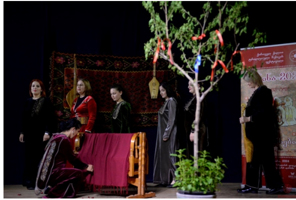
Image 3. “Batonebi”. The second traditional music festival “Nanina-2024”, State Folklore Center (Web 3)

Obviously, we must note that there are similarities among lullabies with different social and ritual functions in terms of musical intonations, verbal expression, and their psycho-physiological impact on individuals and society (Tsurtsumia, 2020, p. 48).